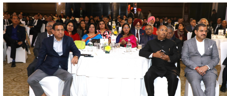
Section of the Audience during the platinum Jubilee Celebration

Various cultural activities were also organized during the Platinum Jubilee celebrations, which made the event even more spectacular. The members and audience present during the program appreciated these activities. Glimpses of these cultural activities are given in the following pages.