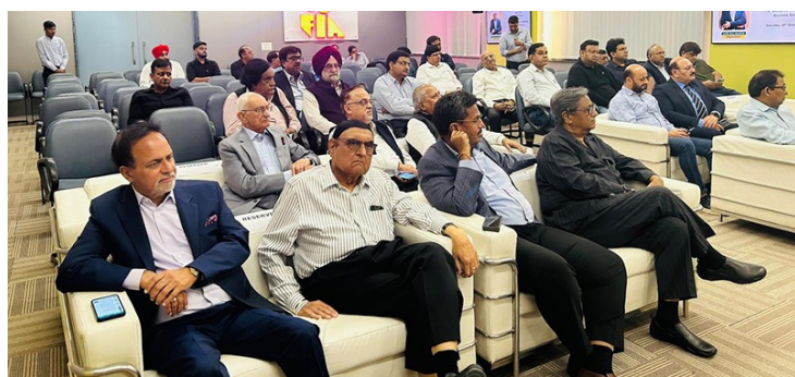
Section of the Audience during the business session